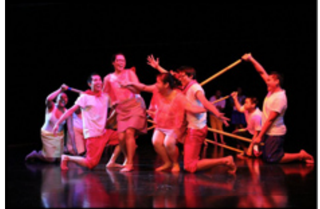
February 5 - PDT Unity Showcase, the revival & only second annual showcase coordinated by the Pagkaka-isa Dance Troupe, celebrating diversity on campus.