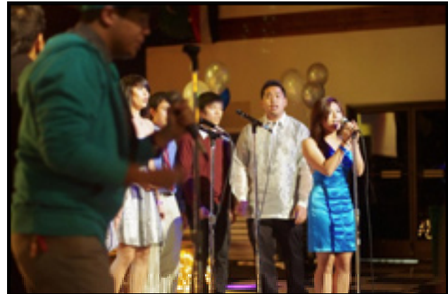
February 13 - Productions of Color Winter Formal, a fundraising collaborative event between the Pilipino Cultural Celebration, Los Mejicas & Indian Student Organization to spread awareness about Mainstage.