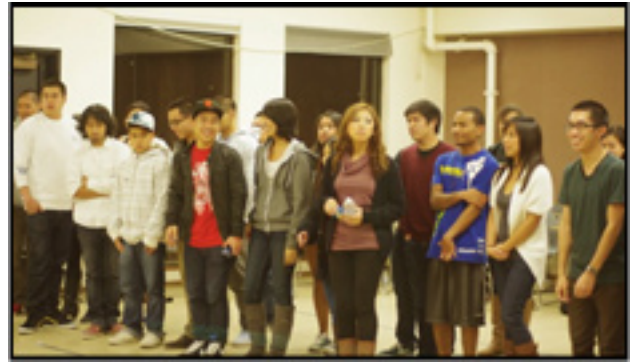
February 1 - FSA General Body Meeting, discussing the issues of diversity on this campus, how we as students of color are marginalized in higher education.