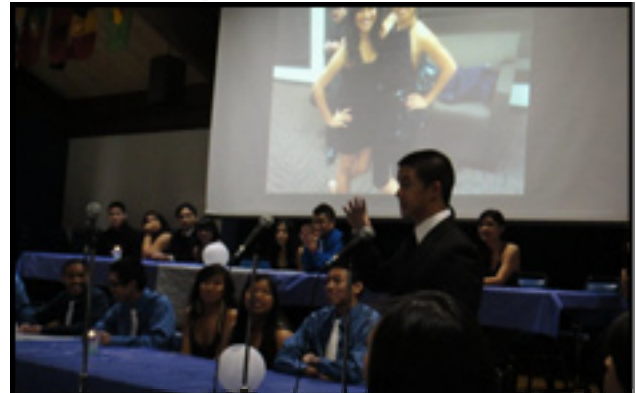
February 26 - Kasama Cotillion, "Dreaming in the Moonlight," the 3rd Annual Cotillion showcase about Filipina identity & coming of age.